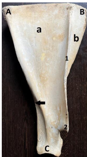
Fig. 1: Lateral surface of scapula of mithun showing (A) Caudal angle, (B) Cranial angle, (C) Distal angle, (a) Infraspinous fossa, (b) Supraspinous fossa, (1) Scapular spine, (2) Acromion process and black arrow showing Nutrient foramen.

The cranial border of scapula was found to be thin, sharp and convex at the upper half but smooth and concave at the lower half. The caudal border was rounded, slightly concave and the thickest of the borders. The dorsal border was found to be convex, pitted and thick where the spine met the border and towards the two ends. The dorsal border formed cranial angle and caudal angle with the cranial border and caudal border, respectively (Fig. 1). The caudal angle was found to be slightly thicker than the cranial angle. The distal angle of scapula was thick and comprised of a glenoid cavity and tuber scapula. The rim of glenoid cavity was found to be roughly quadrilateral in outline (Fig. 3). This finding was in agreement with Chaurasia et al. (2020) in Sahiwal cattle. Tuber scapula was separated by a small distance from the cranial aspect of glenoid cavity ( 0.45 \pm 0.05 cm), a small and smooth coracoid process was found to be situated at its medial aspect. A wide notch and a narrow notch were found to be present at the lateral and cranio-medial aspect of the glenoid rim, respectively (Fig. 3).