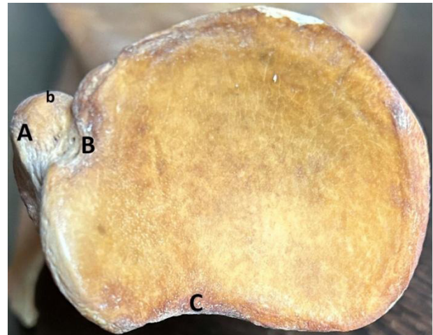
Fig. 3: Distal angle of scapula of mithun showing (A) Tuber scapula, (b) Coracoid process, (B) Narrow notch at cranio-medial aspect of glenoid cavity and (C) Wide notch at lateral aspect of glenoid cavity.

The nutrient foramen at the caudal border was situated 9.30 \pm 0.46 cm away from the caudal margin of glenoid cavity (Fig. 1). The presence of foramen near the distal end of the spine was also observed. The depth of glenoid cavity at the center was 0.81 \pm 0.07 cm and having a circumference of 17.07 \pm 0.59 cm. The cranio-caudal and latero-medial transverse diameters were 5.42 \pm 0.16 cm and 4.58 \pm 0.15 cm, respectively. The circumference of scapular neck was found to be 13.05 \pm 0.47 cm (Table 1).