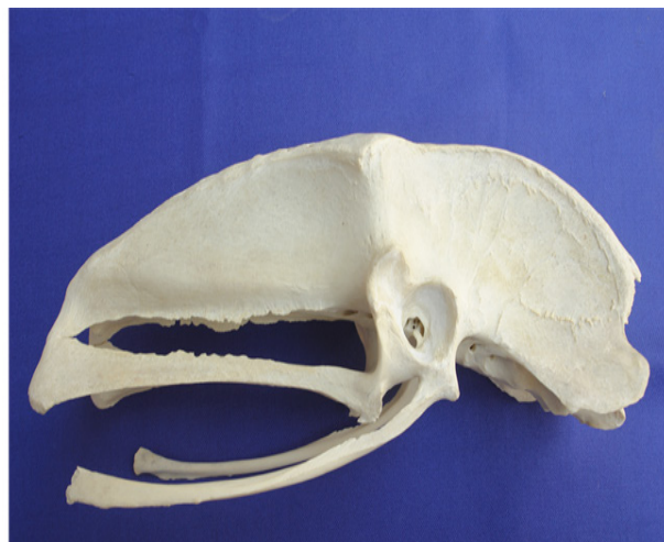
Fig. 3: Pelvic girdle of Emu (Lateral View) showing ilium, ischium and pubis: (A1) Pre-acetabular region of ilium, (A2) Acetabular region of ilium, (A3) Post-acetabular region of ilium, (B1) Anterior vertical part of ischium, (B2) Anterior horizontal part of ischium, (B3) Posterior elongated part of ischium, (C1) Cranial part of pubis, (C2) Caudal part of pubis. Arrows indicate muscular ridges on the pre-acetabular part

The pre-acetabular region was the cranial part in the form of a rough quadrilateral plate having two surfaces and two borders above acetabulum. The surfaces were lateral and medial. The borders were dorsal, ventral, cranial and caudal. The lateral surface was wide, concave and presented several muscular ridges on it. Dorsal border of the pre-acetabular part was a thin and curved plate that enclosed medially the spinous process of the last two thoracic and lumbar vertebrae along with its fellow. The ventral border was projected forward and outward to enclose more space for the synsacrum. The cranial border was notched at the middle and projected laterally. The caudal border joined with the acetabular part. In Ostrich, the ventral border of pre-acetabular part of ilium was projected forward and outward to enclose more space for the body of the vertebrae. The anterior border at the middle was projected laterally forming a notch (Ushakumary and Geetha Ramesh, 2002).