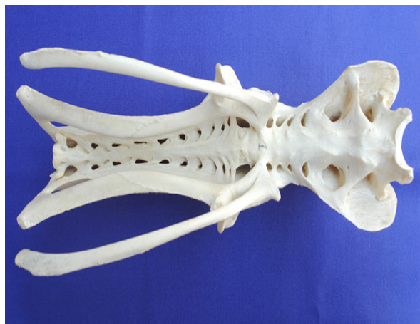
Fig. 2: Pelvic girdle of Emu (Ventral View) (The line indicates Synsacrum

between the bony pelvis and synsacrum. It provided maximum area for the attachments of the massive hind limb muscles. The symphysis pelvis was found open.