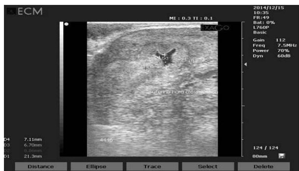
Fig. 1 : Sonograph showing the presence of little amount of anechoic fluid in the lumen of uterine horn on Day 18 post AI in a Surti buffalo.

On Day 18 post-AI, a very little amount of anechoic fluid was seen in the lumen of uterine horn ipsi-lateral to CL (Fig.1) indicating sign of probable pregnancy. At this stage the echoic uterine wall along with anechoic fluid could be easily identified. In none of the animals examined at this stage the embryo proper could be visualized. The appearance of fluid in the uterine lumen was not a sure sign of pregnancy as 4 animals that evidenced fluid on Day 18 were found to be non-pregnant at later days of evaluation. Similar findings were previously reported by Pawshe et al. , (1994).