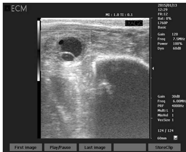
Fig. 2 : Sonograph depicting the presence of amniotic vesicle on Day 26 as confirmatory diagnosis of early pregnancy in a Surti buffalo.

formation was recorded. Anechoic amniotic vesicle formation was observed in fluid filled uterine chamber and could be easily identified (Fig. 2).