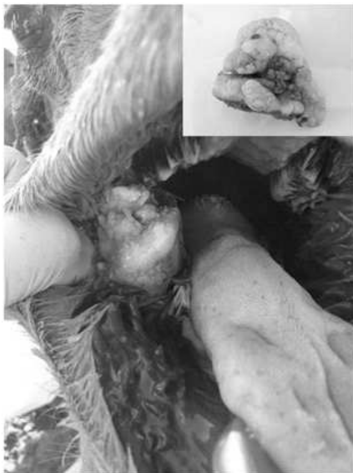
Fig. 1: Camel showing solid, irregularly shaped, greyish-pink cauliflower like abnormal mass attached to right cheek mucosal wall. Inset showing exteriorized abnormal mass.

The animal was fasted for 24 hours. For exteriorization of the abnormal mass the animal was restrained in sternal recumbency