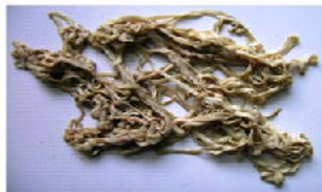
Fig. 2 Tapeworms recovered from intestine of Nilgai